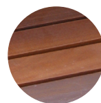
tropical wood FSC