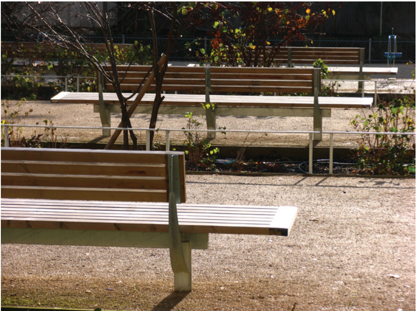
Vacanson square, Patin (France)