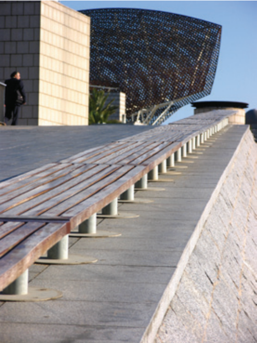
Port Olímpic, Barcelona (Spain)