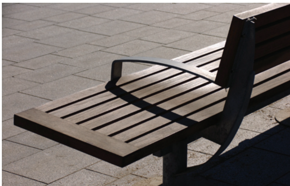
Barceloneta side walk, Barcelona (Spain)

NU Bench 3.70m with backrest, pine / tropical wood: 79 Kg / 109 Kg.