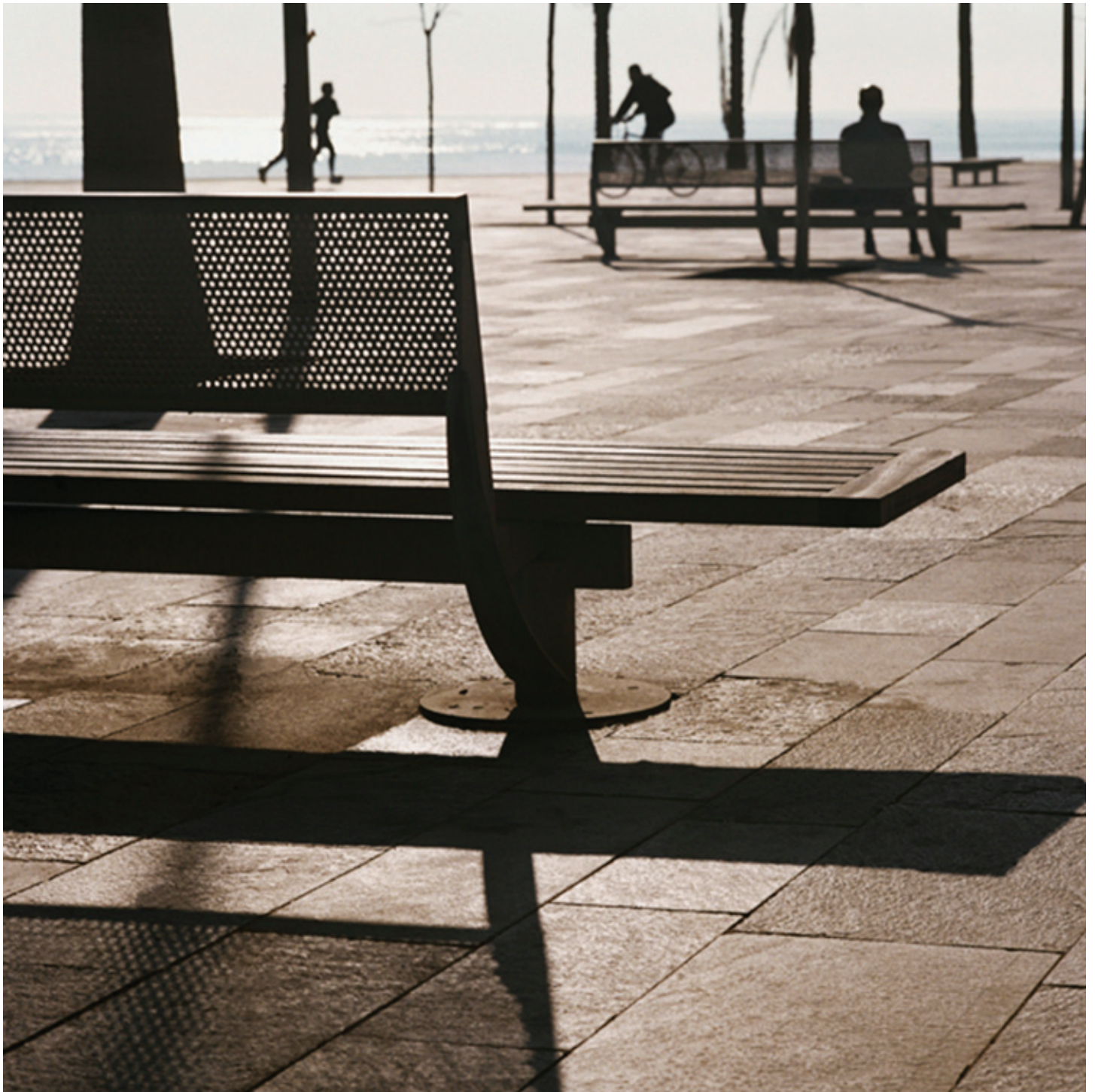
Barceloneta, Barcelona (Spain)